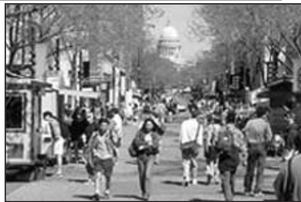
STROLLIN' ON STATE: UW-Madison sits in a city that offers students a good time and graduates possibilities for job placement.

high standard for athletics. UW competes