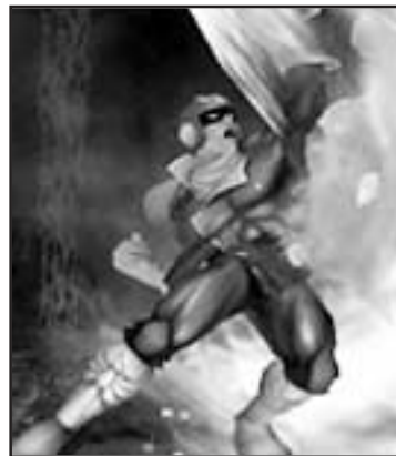
Super Smash Bros-Nintendo

Nintendo has always been a favorite of many when it comes