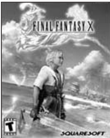
Final Fantasy X - Playstation

Of all three systems, PlayStation 2 has the most games. With backwards compatibility, a player can play all old PlayStation games on