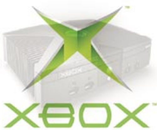
10 staff members rated Gamecube, Xbox, and PlayStation 2 in a play test.