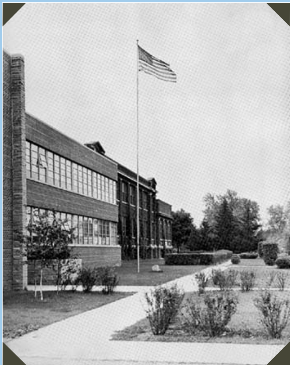
NOVEMBER 18, 1962: AFTER AN ADDITION IN 1953, THE ENROLLMENT ROSE BY 450 STUDENTS TO 858. THE NEXT ADDITION TO THE SCHOOL INCLUDED SCIENCE LABS, A LIBRARY, AND A CAFETERIA.