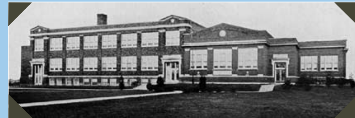
1927: THE FIRST OF MANY ADDITIONS IS ADDED TO THE SCHOOL WITH A TWO-AND-A-HALF-STORY WING CONTAINING MANY NEW CLASSROOMS. THE SCHOOL'S ENROLLMENT REACHED 184 STUDENTS.