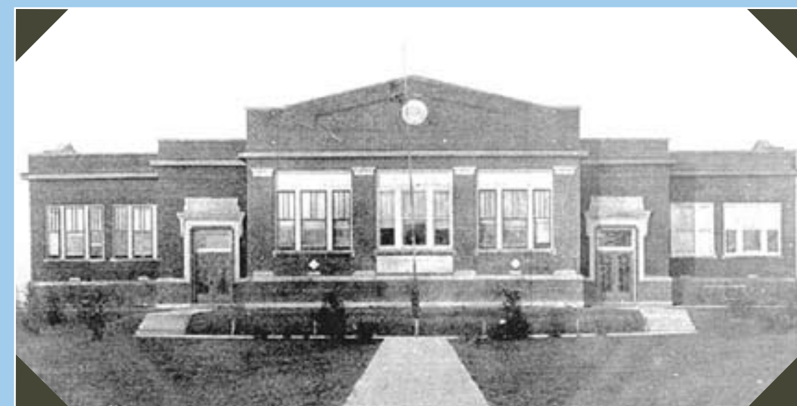
MARCH 24, 1916: ANTIOCH HIGH SCHOOL STUDENTS LEAVE THE ANTIOCH GRADE SCHOOL AND START ATTENDING THE NEW ANTIOCH TOWNSHIP HIGH SCHOOL.