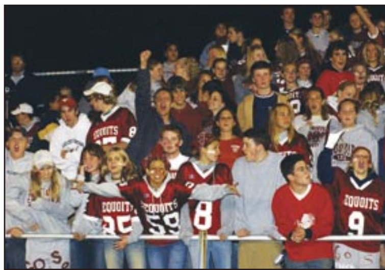
Sequoit football fans pack the stands at the Antioch vs. Round Lake game last Friday night. The Sequoits won, 37-10.