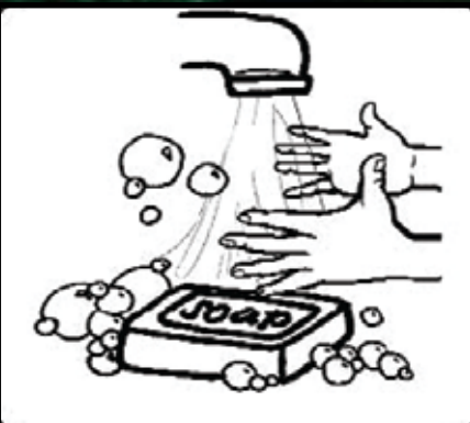
Be sure to keep your hands clean with plenty of soap and hot water.