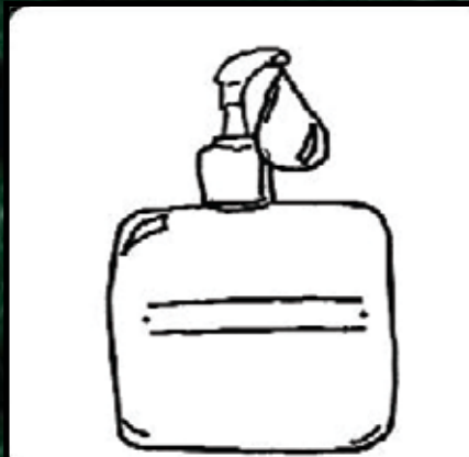
Use an alcohol-based soap or disinfectant when taking care of household items.

alcohol and tobacco. Cover your mouth and nose with a tissue when coughing or sneezing.