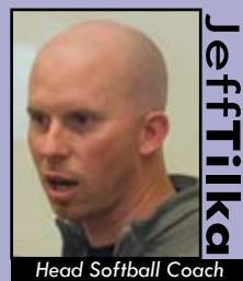
Head Softball Coach